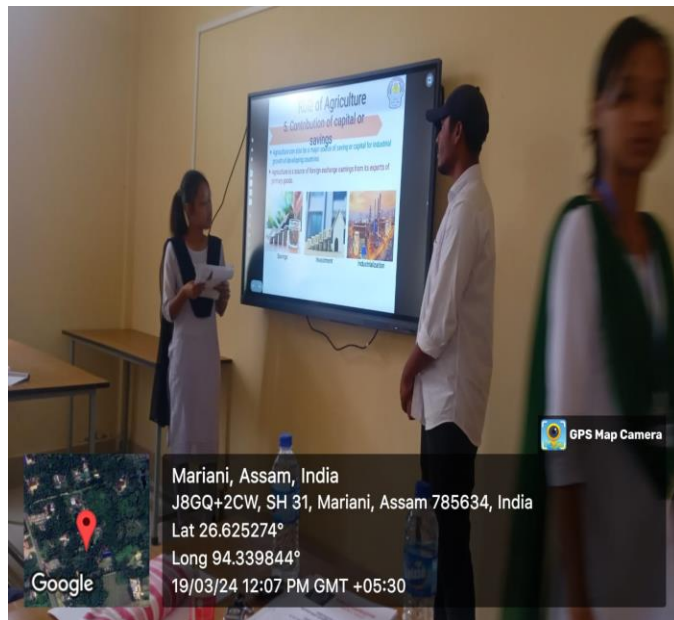
Mariani, Assam, India J8GQ+2CW, SH 31, Mariani, Assam 785634, India Lat 26.625274° Long 94.339844° 19/03/24 12:07 PM GMT +05:30