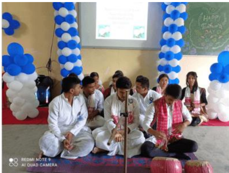
FIG: Teachers day celebration