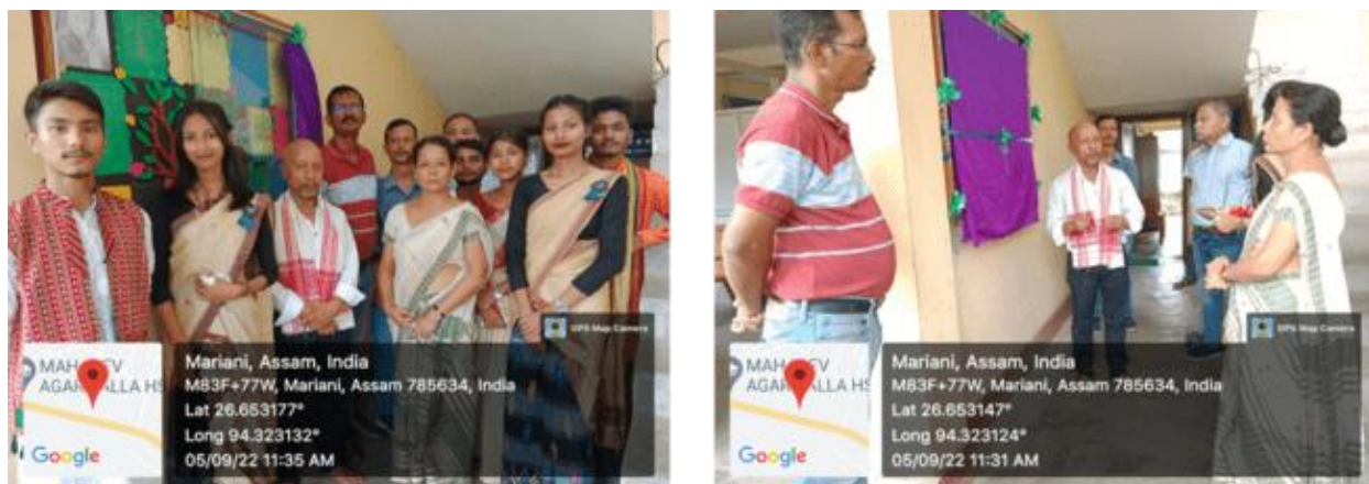
FIG: Student Seminar presentation