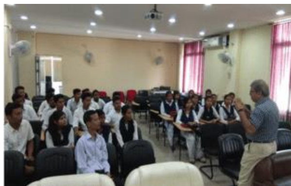
FIG: Exposure visit to Biotechnology Department, AAU, Jorhat