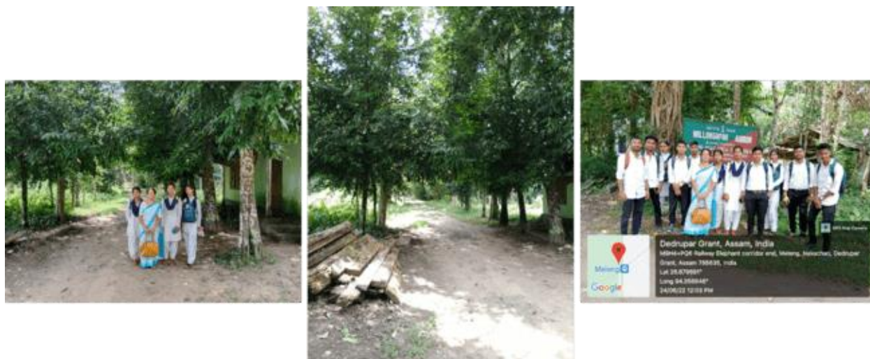
FIG: Visit to Gibbon Sanctuary