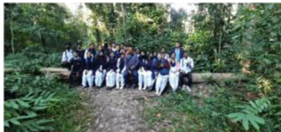
FIG: Field visit to Gibbon Sanctuary