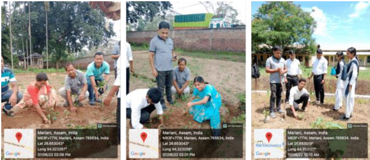
FIG: Tea clones plantation in the Botanical gardens