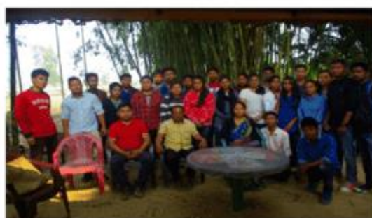
FIG: Field visit to Progoti Krishi Farm