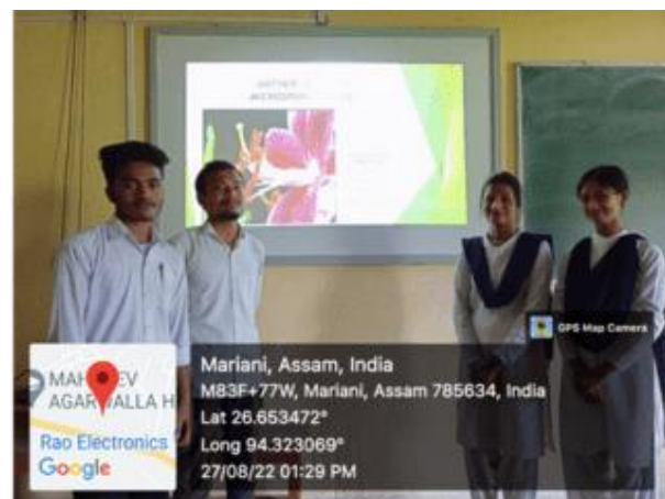
FIG: Student Seminar presentation