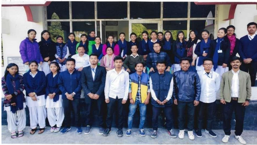
Technology Orientation Programme on Muga and Eri Silk Technology from 11th to 15th December, 2018 at CMER&TI, Central Silk Board, Lahdoigarh, Jorhat, Assam