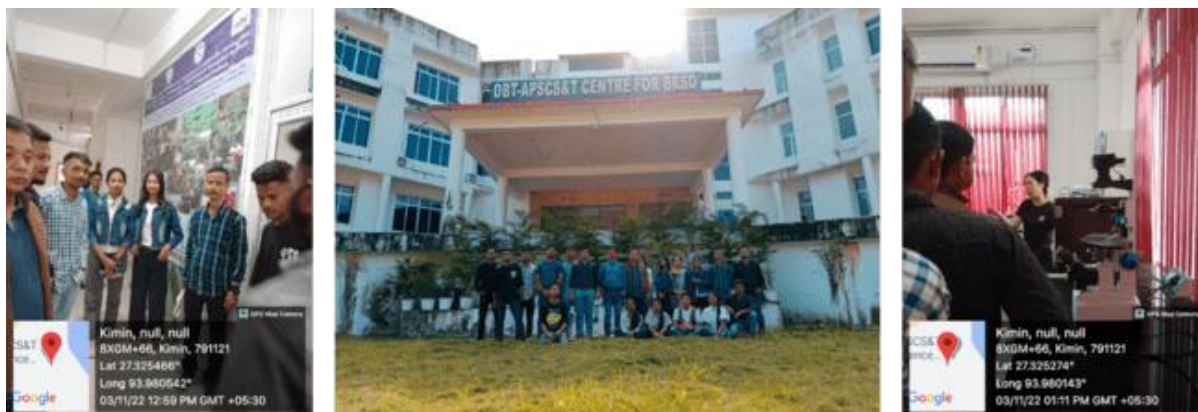
FIG: Visit DBT-APSCS & T CENTRE FRO BRSD, Kimin, Arunachal Pradesh