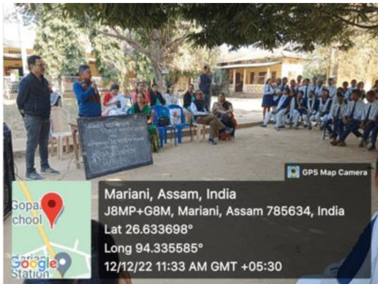
FIG: Quiz competition, Bongs Gopal High School