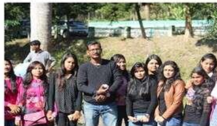
FIG: Field visit to Kaziranga National Park