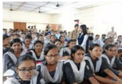
FIG: Two days career counseling Programme