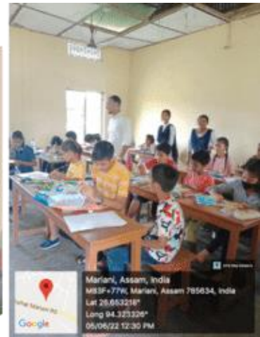
FIG: Drawing competition amongst the school children