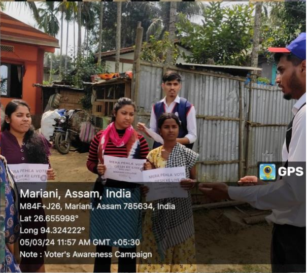
Mariani, Assam, India M84F+J26, Mariani, Assam 785634, India Lat 26.655998° Long 94.324222° 05/03/24 11:57 AM GMT +05:30 Note : Voter's Awareness Campaign