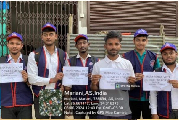
Mariani,AS,India Mariani, Mariani, 785634, AS, India Lat 26.661112, Long 94.316373 03/06/2024 12:40 PM GMT+05:30 Note : Captured by GPS Map Camera