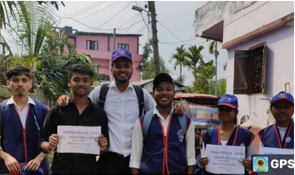
Mariani, Assam, India M84F+J26, Mariani, Assam 785634, India Lat 26.656077° Long 94.324026° 05/03/24 12:02 PM GMT +05:30 Note : Voter's Awareness Campaign