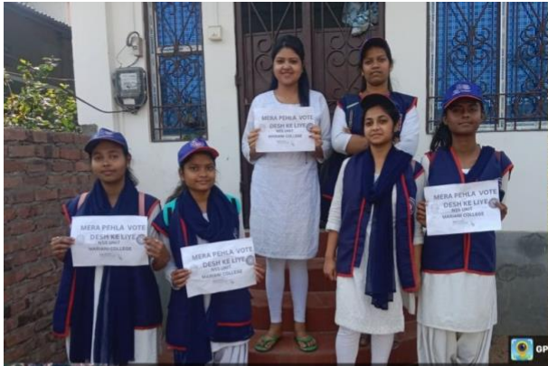
Mariani, Assam, India Pukur par, ward no. 3, Mariani, Assam 785634, India Lat 26.65446° Long 94.315953° 06/03/24 01:11 PM GMT +05:30