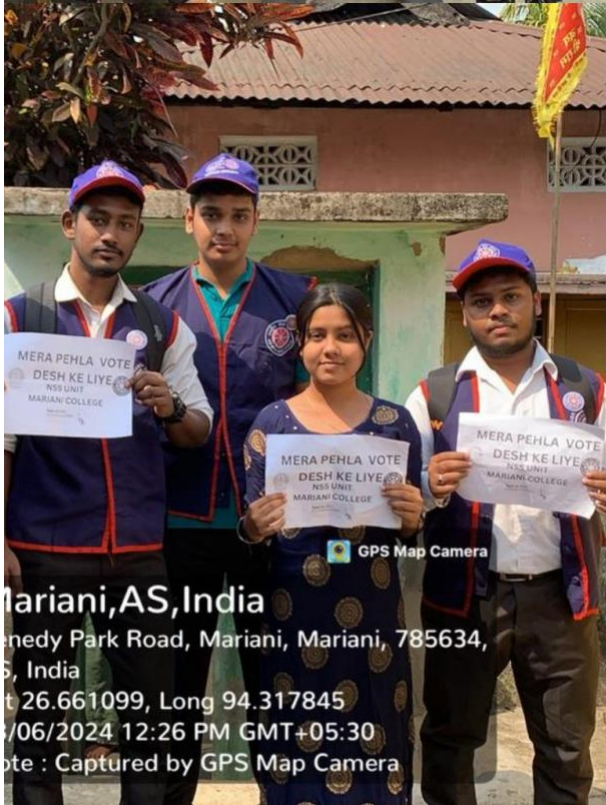
Mariani,AS,India Sneedy Park Road, Mariani, Mariani, 785634, AS, India Lat 26.661099, Long 94.317845 03/06/2024 12:26 PM GMT+05:30 Note : Captured by GPS Map Camera