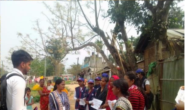
Mariani, Assam, India Ward no 6, Gandhi Nagar, Mariani, Assam 785634, India Lat 26.654957° Long 94.323947° 05/03/24 11:21 AM GMT +05:30 Note : Voter's Awareness Campaign