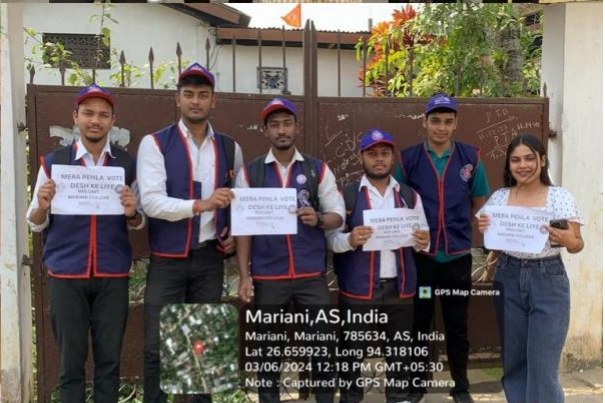
Mariani,AS,India Mariani, Mariani, 785634, AS, India Lat 26.659923, Long 94.318106 03/06/2024 12:18 PM GMT+05:30 Note : Captured by GPS Map Camera