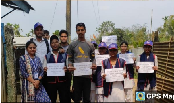
Mariani, Assam, India 2no ward, near Ganesh mandir, Gandhi Nagar, Jorhat, Mariani, Assam 785634, Indi Lat 26.654978° Long 94.327329° 05/03/24 11:38 AM GMT +05:30 Note : Voter's Awareness Campaign