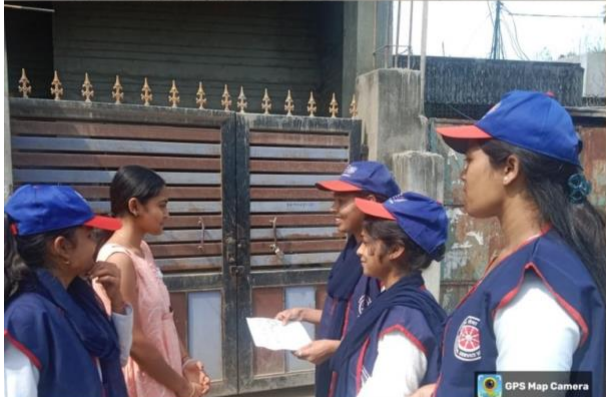
Mariani, Assam, India M838+87W, Mariani, Assam 785634, India Lat 26.653547° Long 94.315523° 06/03/24 12:38 PM GMT +05:30