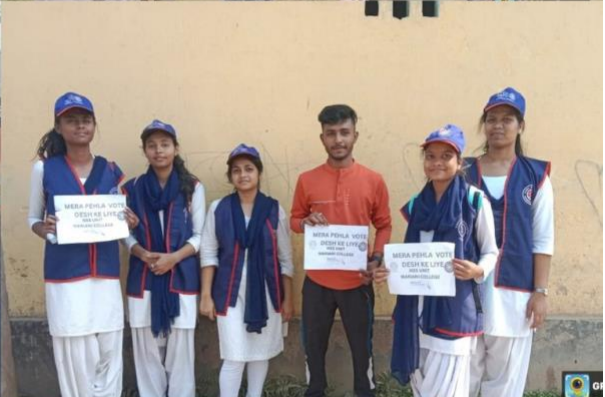
Mariani, Assam, India M848+998, Mariani, Assam 785634, India Lat 26.655781° Long 94.315547° 06/03/24 01:29 PM GMT +05:30