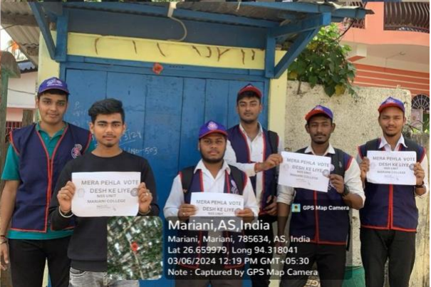
Mariani,AS,India Mariani, Mariani, 785634, AS, India Lat 26.659979, Long 94.318041 03/06/2024 12:19 PM GMT+05:30 Note : Captured by GPS Map Camera