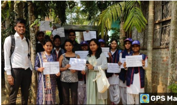
Mariani, Assam, India Ward no 6, Gandhi Nagar, Mariani, Assam 785634, India Lat 26.654957° Long 94.323947° 05/03/24 11:21 AM GMT +05:30 Note : Voter's Awareness Campaign