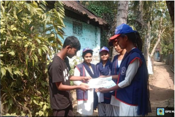
Mariani, Assam, India M837+7VV, Mariani, Assam 785634, India Lat 26.653797° Long 94.3151° 06/03/24 12:48 PM GMT +05:30