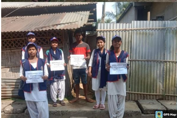
Mariani, Assam, India Pukur par, ward no. 3, Mariani, Assam 785634, India Lat 26.654001° Long 94.316044° 06/03/24 12:58 PM GMT +05:30