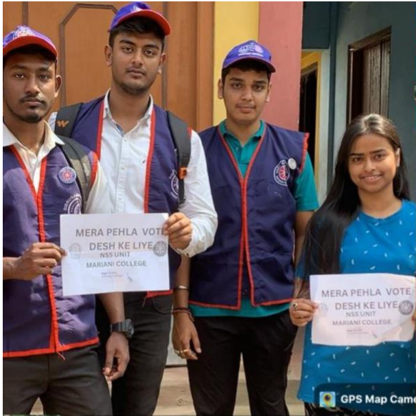
Mariani,AS,India Mariani, Mariani, 785634, AS, India Lat 26.660749, Long 94.318222 03/06/2024 12:33 PM GMT+05:30 Note : Captured by GPS Map Camera