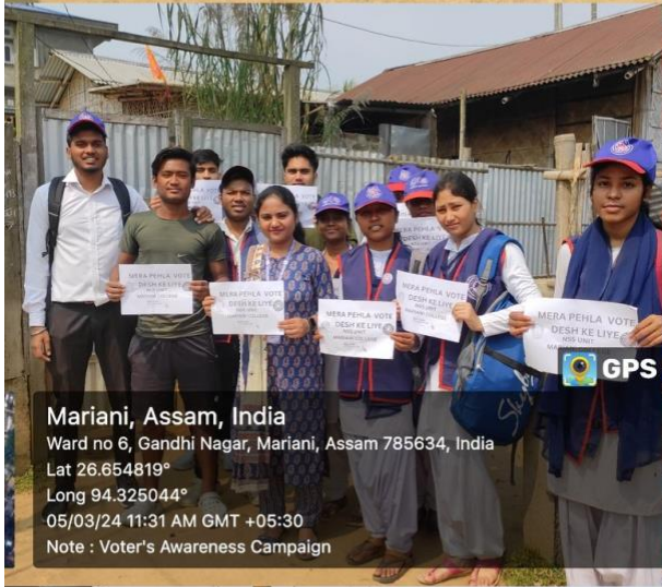
Mariani, Assam, India Ward no 6, Gandhi Nagar, Mariani, Assam 785634, India Lat 26.654819° Long 94.325044° 05/03/24 11:31 AM GMT +05:30 Note : Voter's Awareness Campaign