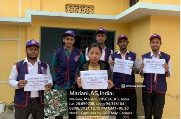
Mariani,AS,India Mariani, Mariani, 785634, AS, India Lat 26.659708, Long 94.318104 03/06/2024 12:15 PM GMT+05:30 Note : Captured by GPS Map Camera