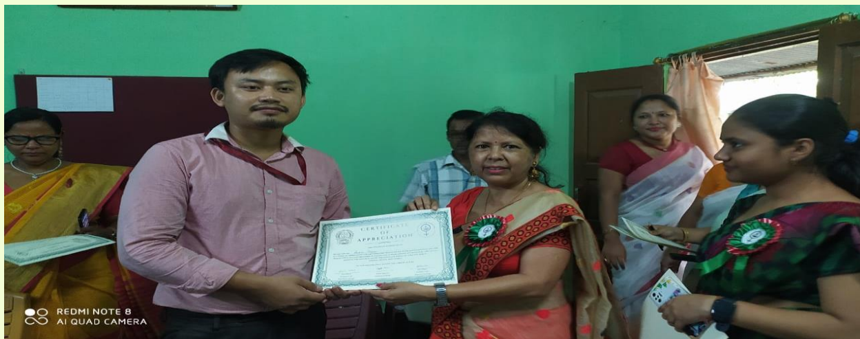
Blood Donation and free Health Check-up Camp