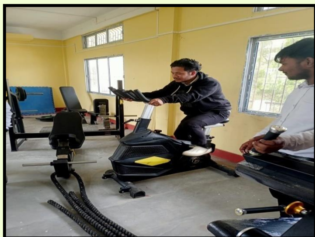
Gymnasium Facility, Outdoor/Indoor Sports Facility