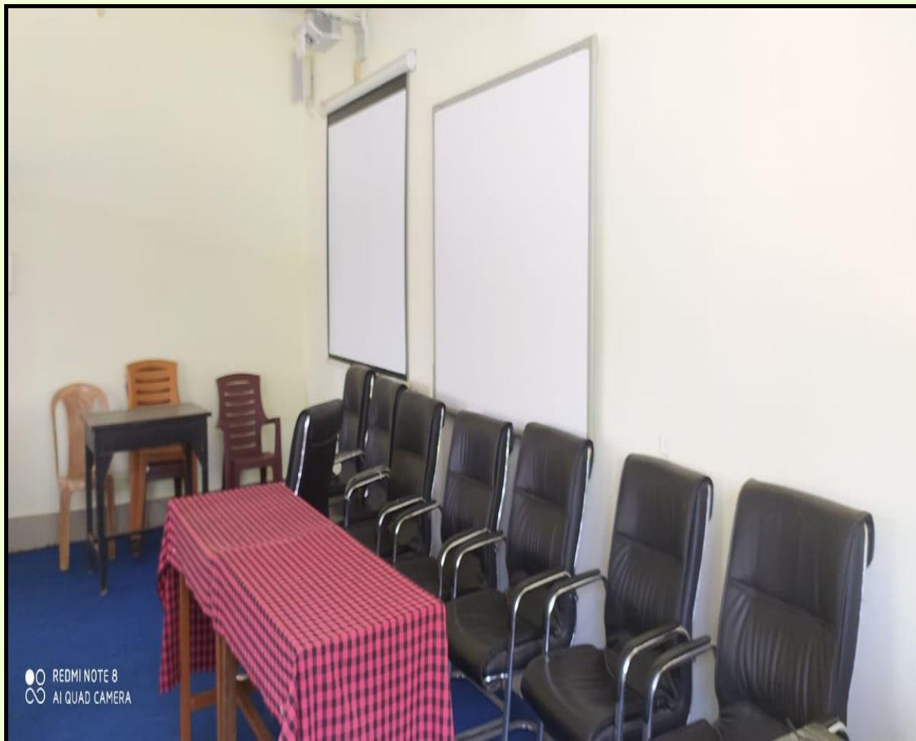
MARIANI COLLEGE SEMINAR HALL