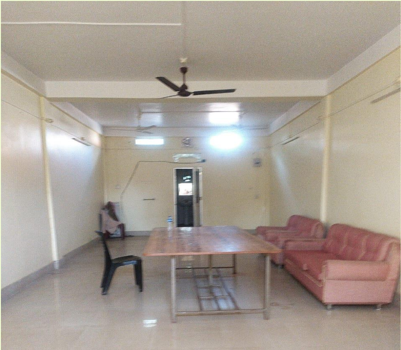
Common cum Refreshment Room for staff