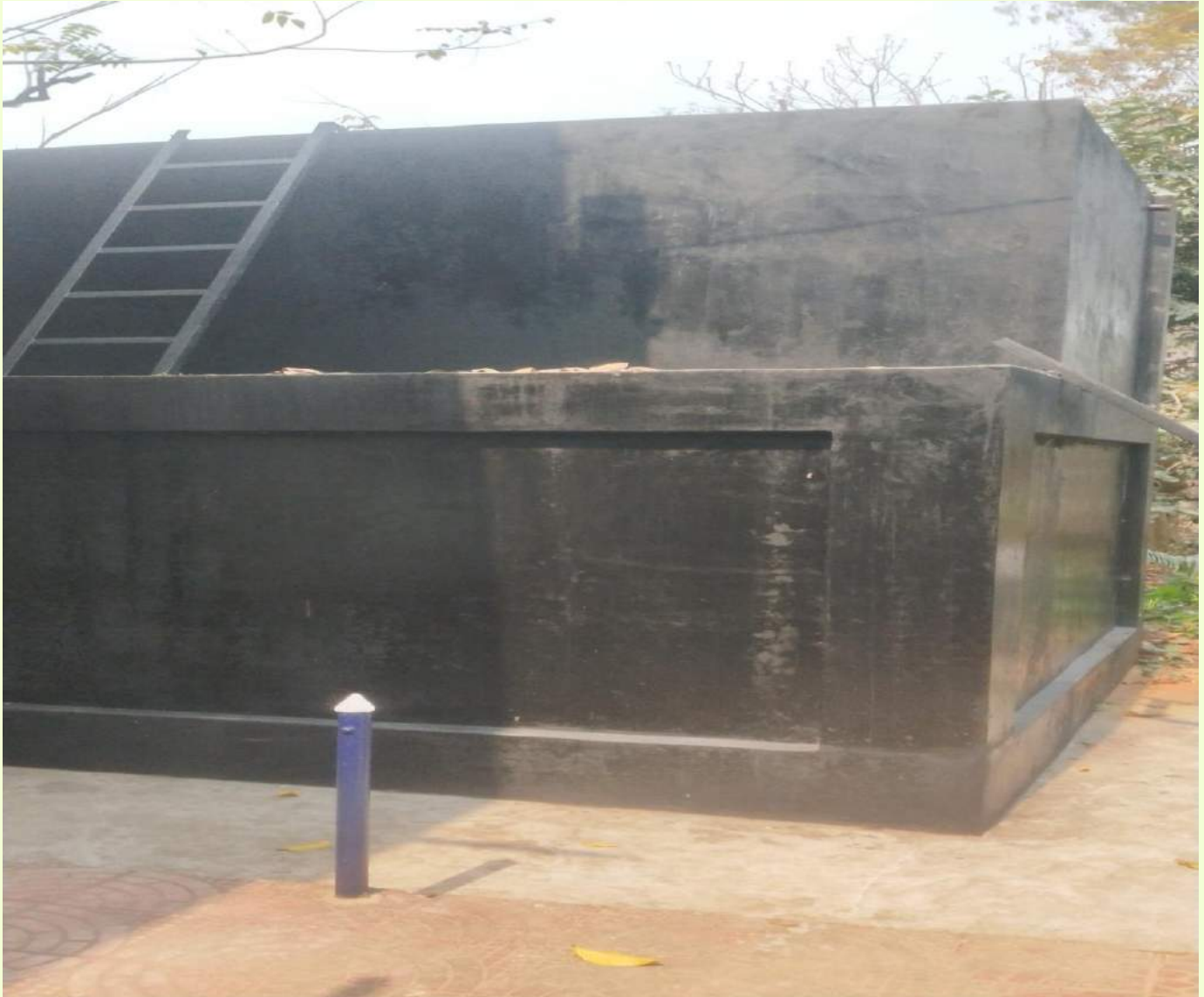
Drinking Water Plant

B. B. B. B. COORDINATOR, IQAC CELL Mariani College, Mariani